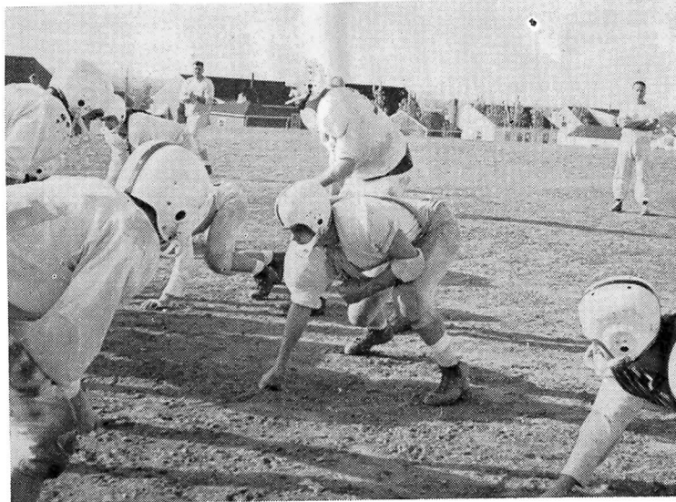
Team Practices Plays for Tonight